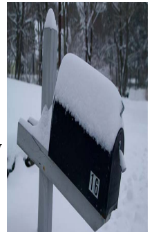
Standard Dimensions for a Mailbox

Most boxes are sturdy enough to stand up to this, but sometimes older or less sturdy boxes take a beating. The Village replaces mailboxes that are actually hit by equipment, but this is rare. It's residents responsibility to maintain mailboxes so that they can stand up to the rigors of winter.