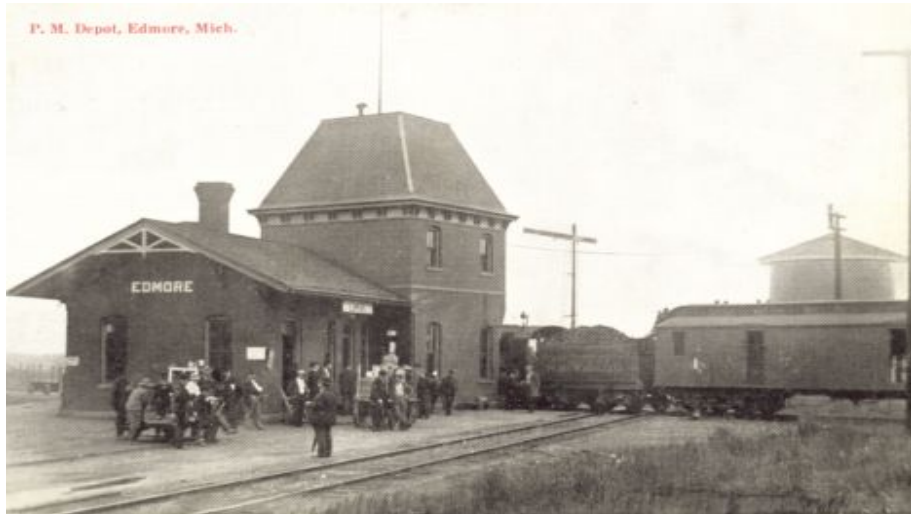
The Pere Marquette Depot in Edmore with a passenger train pulling in and the water tower in the background. To learn more about Edmore visit the Pine Forest Museum @ https://www.facebook.com/PineForestHistoricalMuseum/