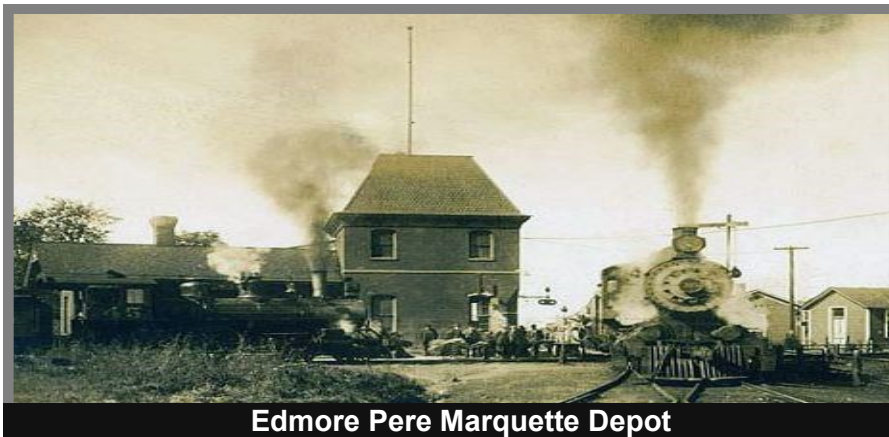
Edmore Pere Marquette Depot

The depot served as the junction of the north-south line and the east-west line. It was located in the lawn east of where Railroad Street curves to the south, on the southeast side of the rail junction. There were two wye tracks to allow interchange between the lines. Today, this railroad grade that goes from Greenville through Edmore then east to Alma is the Fred Meijer Heartland Trail. To learn more about Edmore's history visit the Pine River Historical Museum, 402 E. Home Street. The museum opens for the season on May 3, or visit online https://www.facebook.com/PineForestHistoricalMuseum